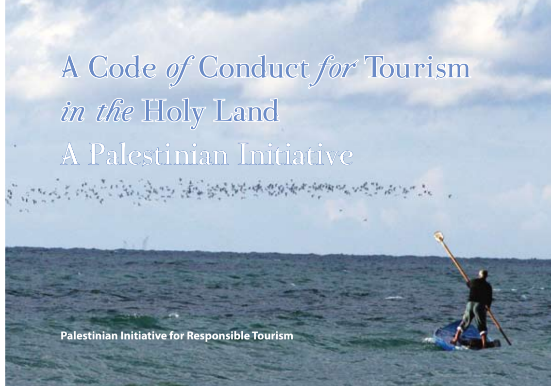
Palestinian Initiative for Responsible Tourism